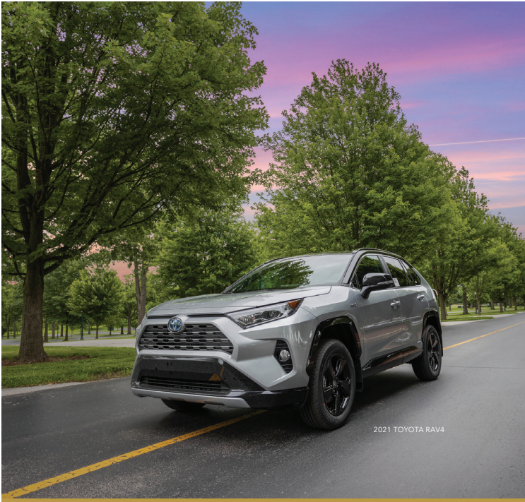
2021 TOYOTA RAV4